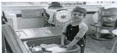
12 Newell Street