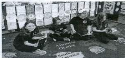
Brooklyn, NY 11222